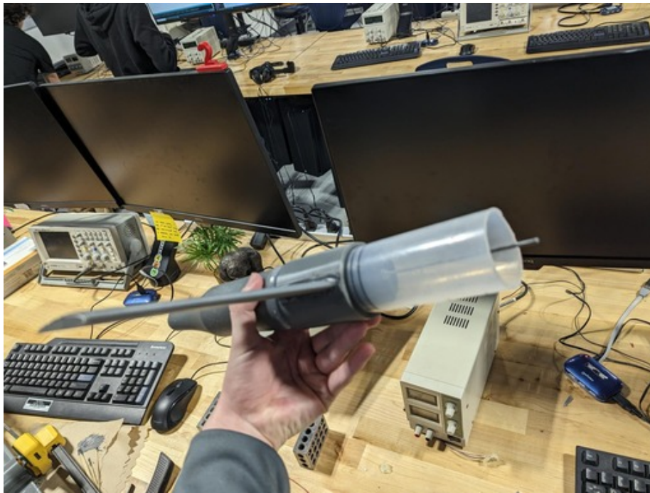
Figure 1: Image of float

I wrote about the first iteration in my blog post from October of 2022 The first iteration was based around a large syringe, and used the syringe seal. We found that there were numerous issues with that design. The housing was too small to fit the electronics in comfortably, and we could not get a strong enough motor to fit. We also could not find a safe way to have a pressure release without flooding the float.